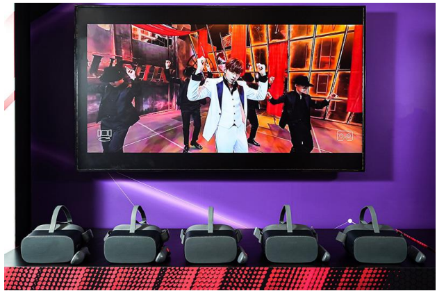
csl. 5G VR application