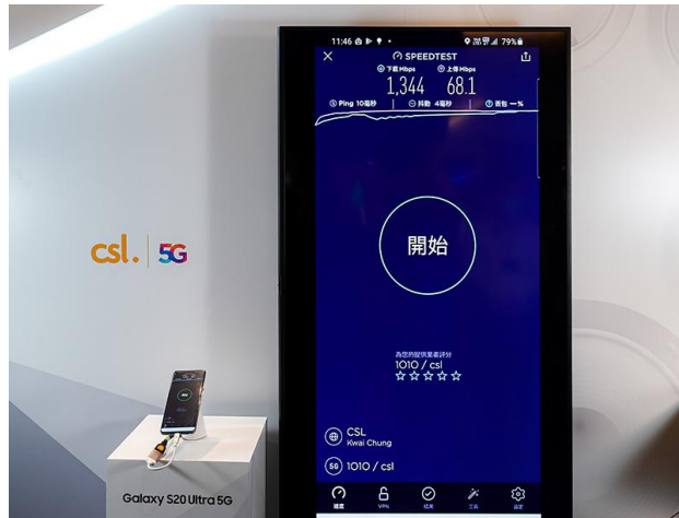
5G speed test on Samsung 5G handset