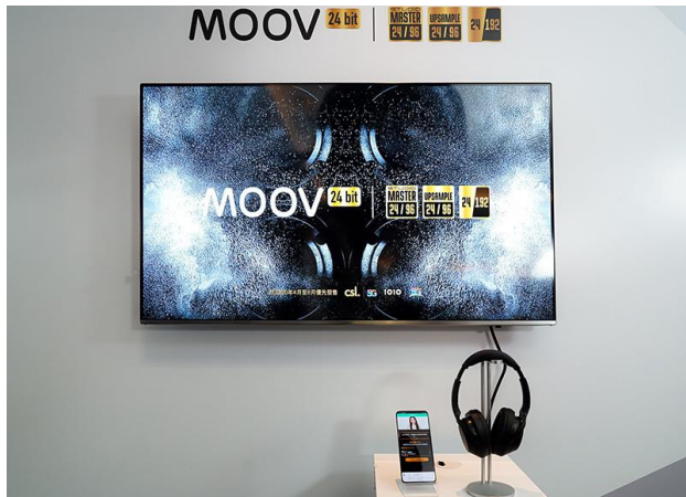
MOOV 24 bit Music Service