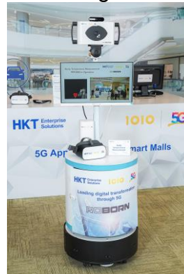
Smart Mall: New shoppers experience empowered by 5G

Please also refer to the appendix ("5G" presentation) .