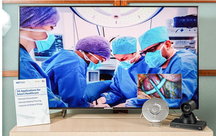
Smart Healthcare: Remote Consultation & Remote Medical Training