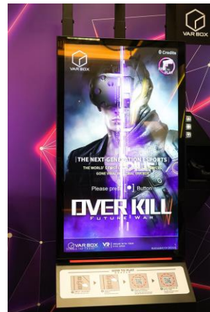
csl. 5G VR eSport